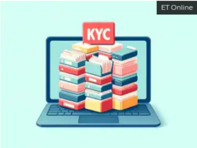
PNB KYC update

PNB customers: Punjab National Bank has asked its customers to update their Know Your Customer (KYC) information in their bank accounts to ensure smooth functioning of their accounts in adherence to the Reserve Bank of India's (RBI) guidelines.