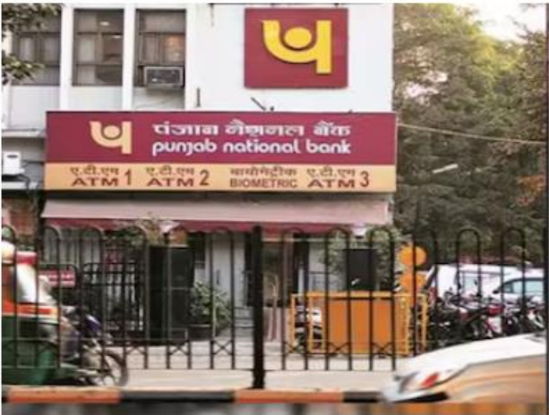
PNB KYC Last Date: Failure to update KYC details within the stipulated time may result in restrictions on account operations. (Representative image)

PNB KYC Last Date: In adherence to the Reserve Bank of India (RBI) guidelines, Punjab National Bank (PNB), a leading public sector bank, has urged its customers to update their ‘Know Your Customer’ (KYC) information by January 23, 2025, to ensure smooth functioning of their accounts.